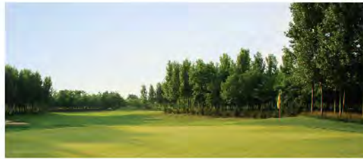
GOLF COURSE VIEW

A renowned township in Johor Bahru with excellent accessibility, Bukit Indah has won numerous accolades for its superb landscaping, quality and design. Popular restaurants, major shopping malls, a hotel and even a convention centre are within walking distance. This vibrant self-contained township replicates the famed Australian Green Street Concept.