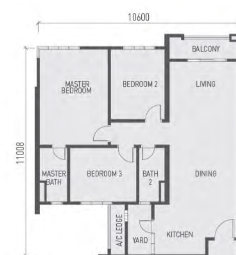
TYPE C 1151 SQ. FT.