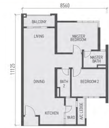
TYPE B 871 SQ. FT.