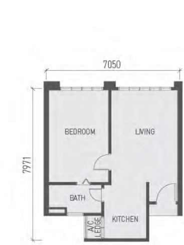
TYPE A 538 SQ. FT.